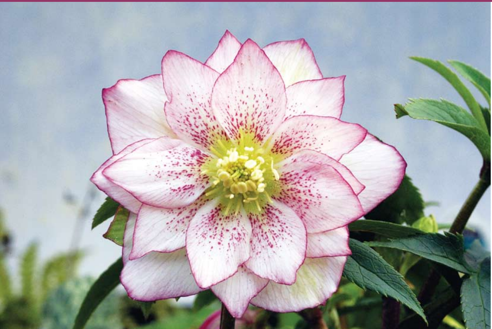
Above: (left and right): Two of the many unique hybrid creations from Glick's hellebore breeding program.

The slope is covered with a sea of hellebore plants, which typically flower in late winter and early spring. Glick grows more than 10,000 taxa, or plant varieties, but the hellebore group is most prominent. Most are native to chilly mountain regions like the Balkans and the Russian Urals, and they like shady hollows, so they do quite well here in Greenbrier.